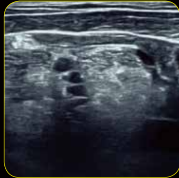
The nerve roots of the interscalene brachial plexus are well defined with the L12-5Q transducer.