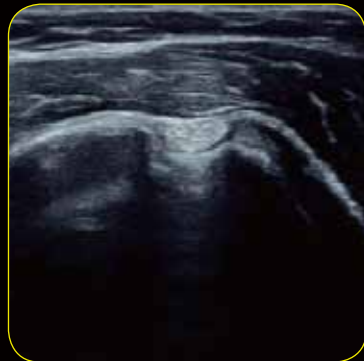
The L12-5Q transducer and Tissue Adaptive Imaging continuously and automatically optimizes multiple parameters resulting in excellent definition of the biceps tendon.