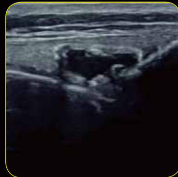
This fluid collection on the anterolateral aspect of the knee is clearly defined with the L12-5Q transducer.