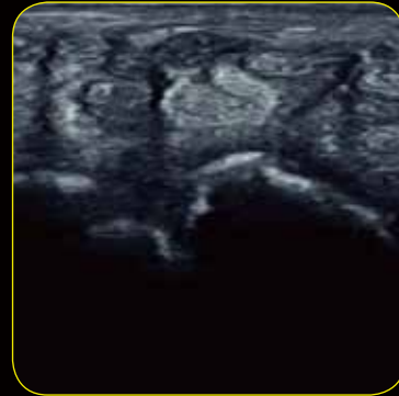
The high-frequency L17-7SQ compact linear array transducer provides excellent superficial detail to easily identify the median nerve.