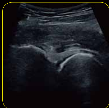
Superior detail and penetration is seen in this normal hip with the C5-2Q transducer.